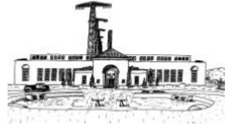
RCA RADIO CENTRAL TRANSMITTING STATION

Celebrating the first transmission over 100 years ago 1921-2024