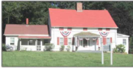
Circa 1721 Noah Hallock Homestead